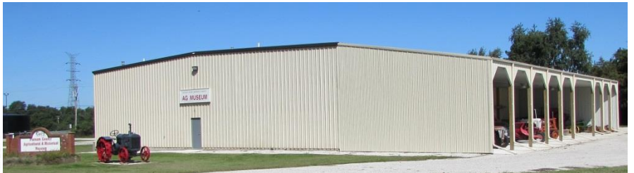
Agricultural Museum in 2019

By 2004 a balcony was built along the west and north walls to expand the available floor space for storage and display. Every year since then we have turned some of the space that was used for storage into display space.