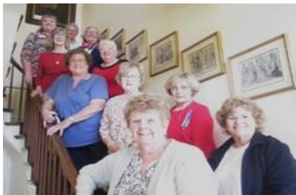
On the stairs at Pulsifer House

Following the tour the Chapter held its October meeting in the Society's Meeting House. Two members toured the Ag Museum following the meeting.