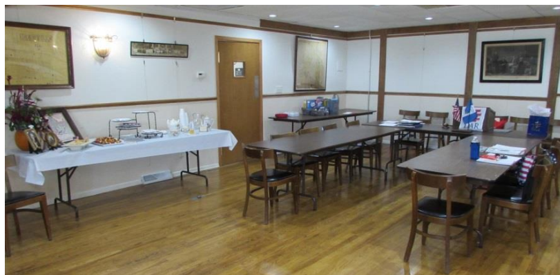
Set up for meeting at the Meeting House