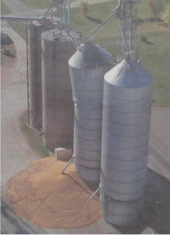
Aerial view looking SW

Illinois Highway Route 26 was closed at Putnam following a partial collapse of a grain silo on October 15 at the River Valley Coop grain elevator spilled corn and threatened the safety of traffic on the highway. State, county, township, and fire district agencies as well as Ameren responded and crews were busy for the rest of the week stabilizing the situation.