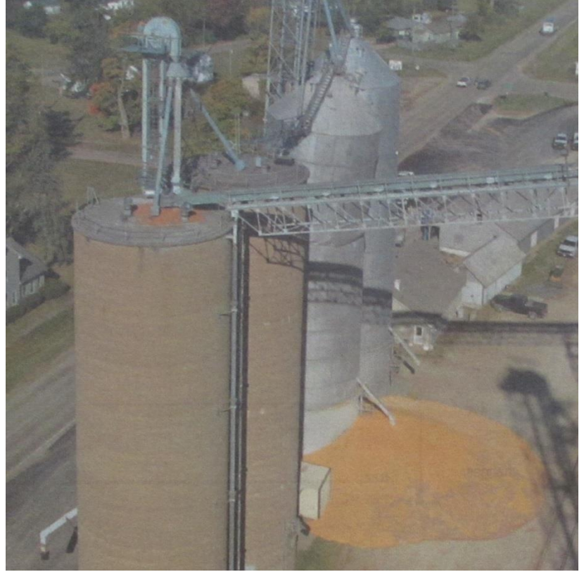
Aerial view looking NW