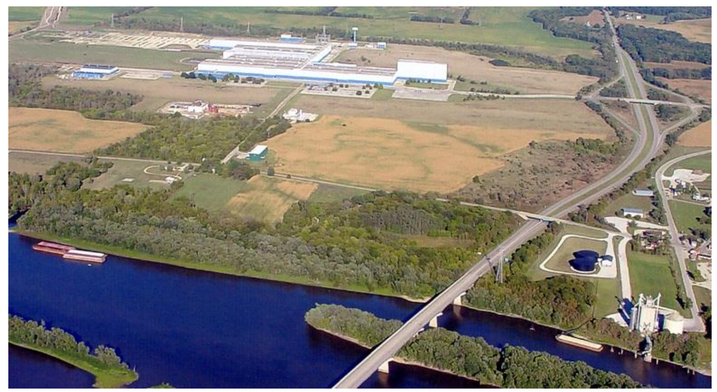
Construction of the first phase of the mill began in 1966 and operations began in December 1967.

The mill received hot rolled coils of steel and produced cold rolled and galvanized sheets and coils that were shipped out by truck or rail. Steel entering the mill went through a 'pickle line' where scale was removed by physical breakers and a hydrochloric acid bath. The steel then