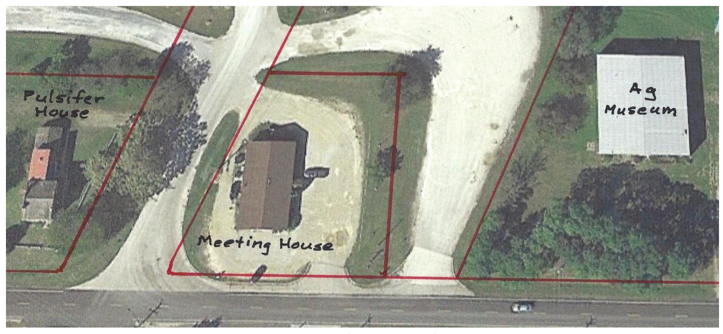
Memorials & Tributes

The location between Pulsifer House and the Ag Museum will be very convenient and the new building is also handicapped accessible. We are currently removing the restaurant equipment and modifying the space for our purposes.